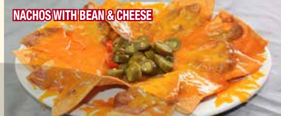
NACHOS WITH BEAN & CHEESE